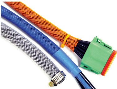
When cut with a hot knife, the sealed ends of Flexo PET allow for varied termination solutions.