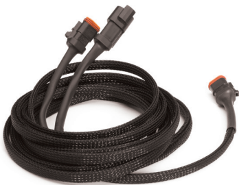
Flexo PET installs quickly in production harnessing environments, reducing assembly cost.